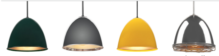
904 british racing green 905 aluminum 906 canary yellow shown with Wire Guard Accessory