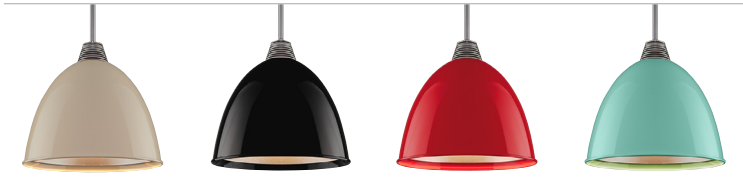
900 ivory 901 black 902 gypsy red 903 larkspur blue